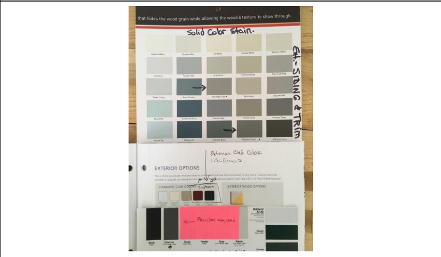
Swatches are ok but may be rejected in favor of physical sample.