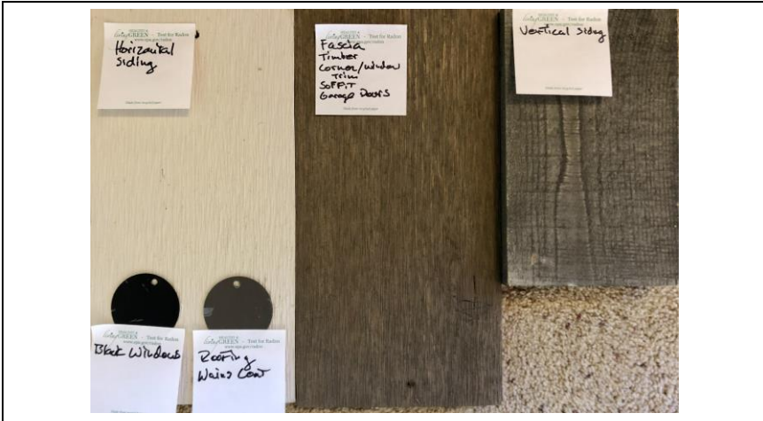
Example of sample size and type. These could be even smaller.

The same goes for post and beams. If you have 8" pine posts for the deck, do not submit finished section of that post. A small piece of rough-cut pine with the finish on it will do.