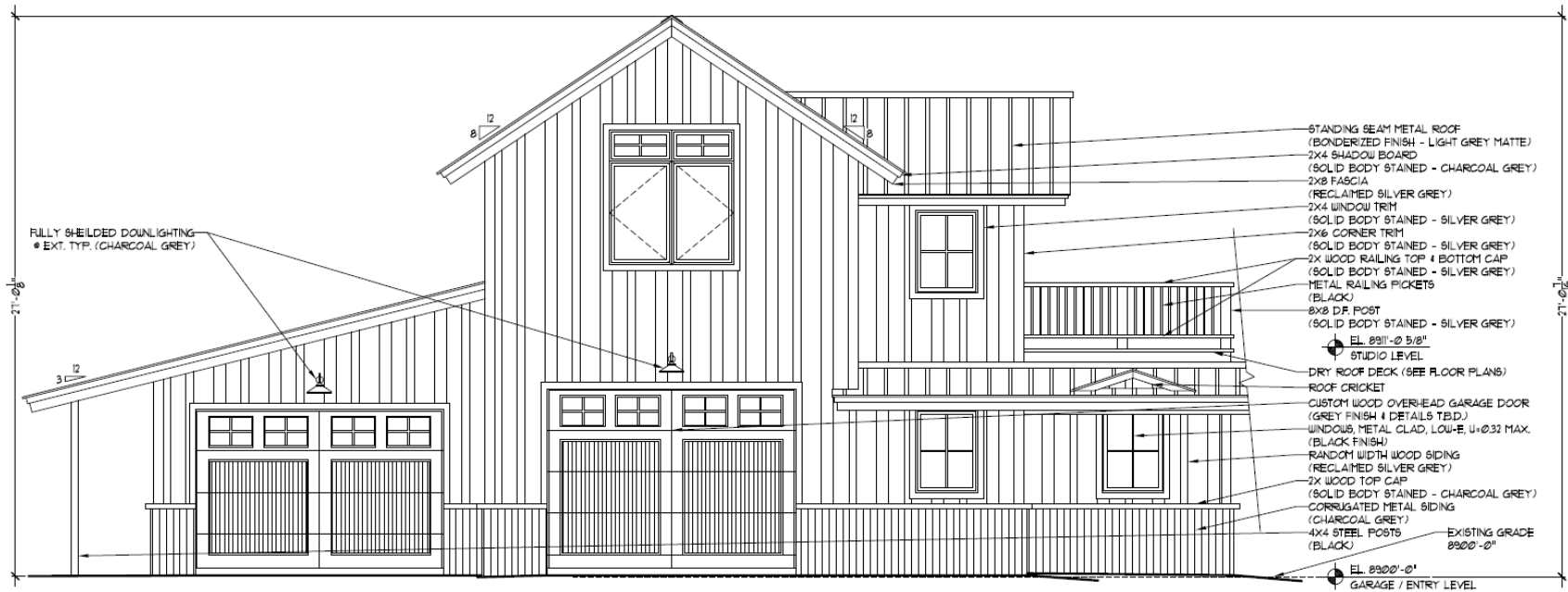
EAST GARAGE ELEVATION SCALE: 1/4"=1'-0"

On the next page is an example of how the physical samples should be submitted.