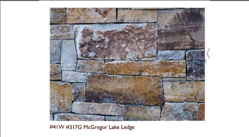
Example of stone sample in picture form